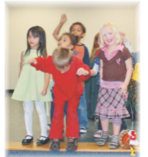
Fun Times for our Kids At The Thanksgiving Dinner